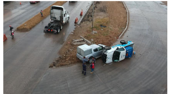
Final position of the vehicles

Approximately, at 6:30 am, an employee of the NDT subcontractor, while driving to the compound, hits a vehicle that was crossing the road. The vehicle that crossed the traffic lane intended to make a U-turn. This manoeuvre is allowed by local regulations. This vehicle was not visible from the road because it was behind a truck that also was waiting for the same manoeuvre. The third party vehicle driver did not wait or notice the traffic before starting the manoeuvre. In this road traffic accident no personal injuries occurred; consequences were limited to vehicles damages.