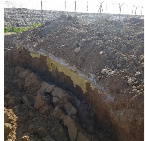
Trench Wall Excavation collapsed.