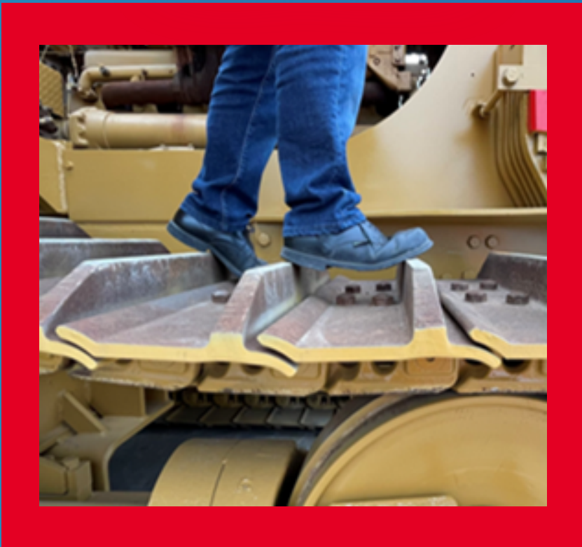
Depleting working conditions.