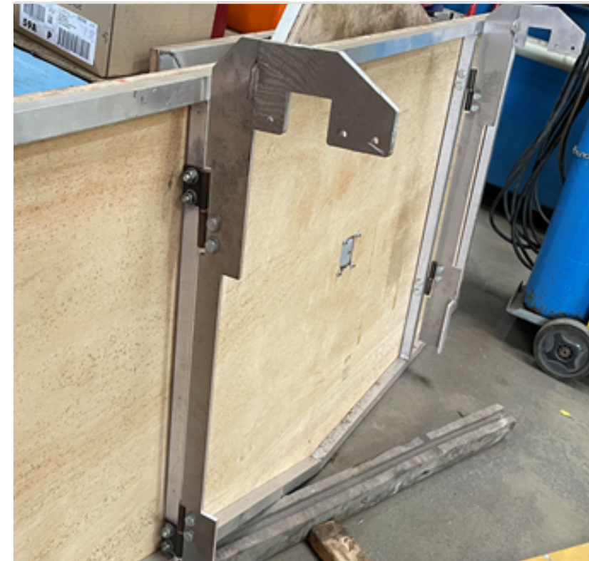
2016 use of the railing system in the workshop