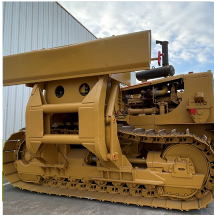
PIPELAYER CATERPILLAR 594