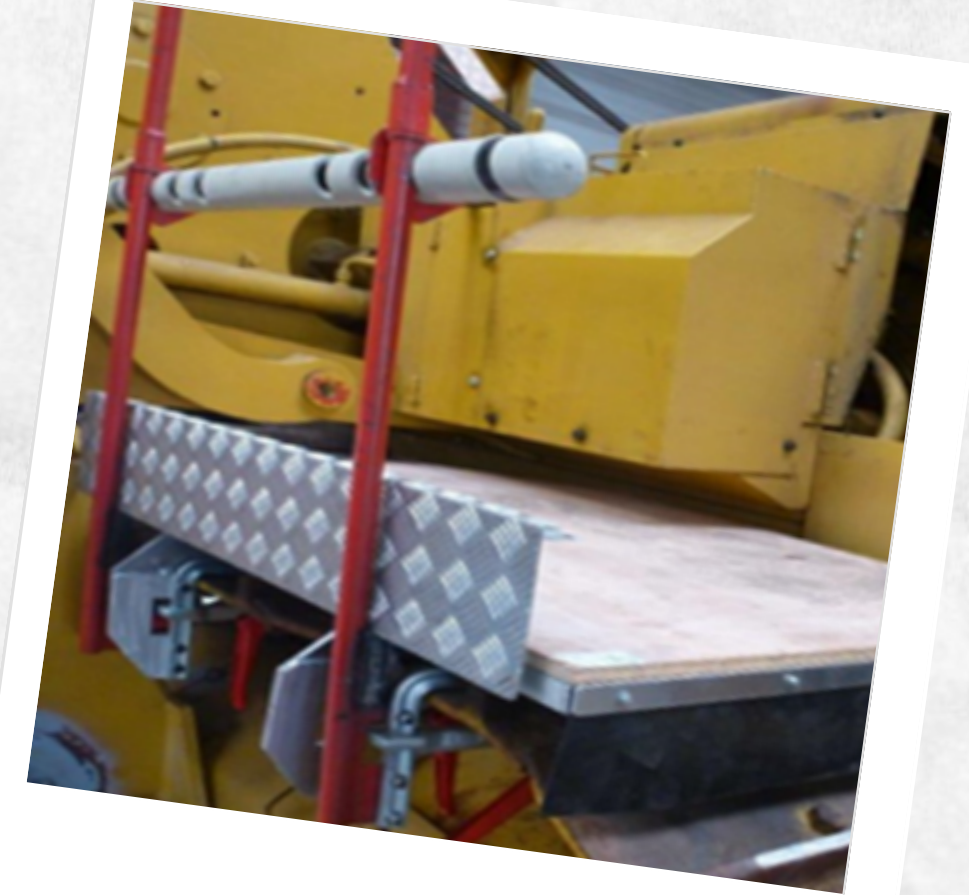
mid 2022 design and manufacturing for Pipelayer Caterpillar 583