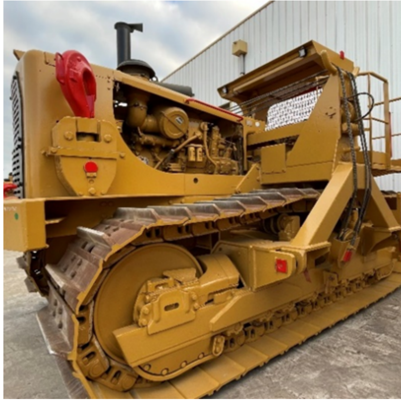
PIPELAYER CATERPILLAR 594