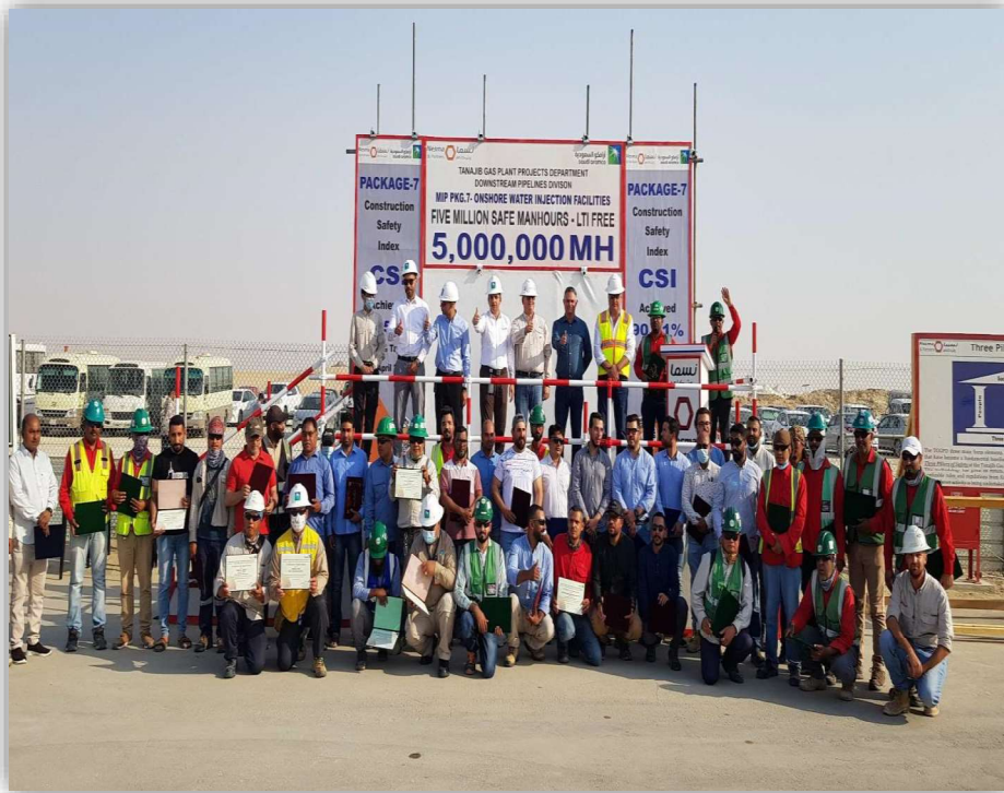
Nesma & Partners (MIP-7) project has celebrated the achievement of Five (5) Million Safe Man Hours with zero LTI